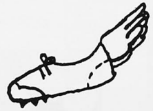
(Left) The Passing of the baton. You can run like the wind, but if you miss the handoff, you'll most likely lose.